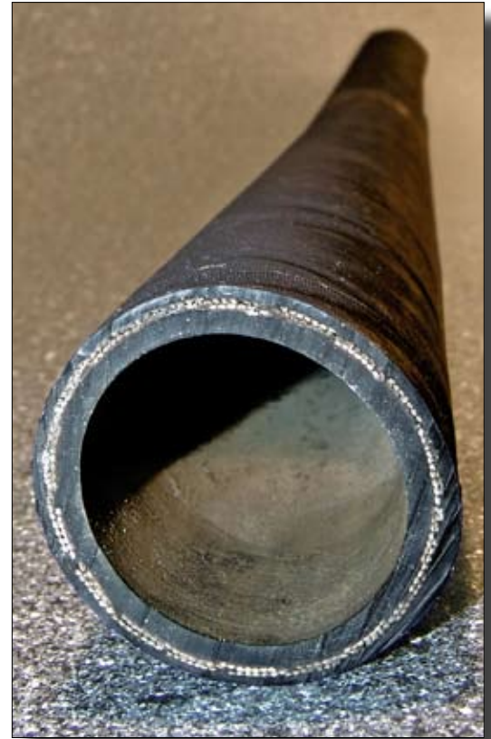
*Sold by 90cm Length

†Other part no. not included in the list are available. Please contact your sales representative if you have any questions. Part Numbers are used for reference purposes only